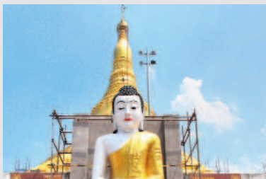
A 60-tonne statue of Buddha at the entrance