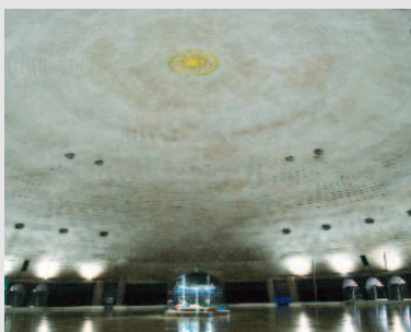
A view inside the Pagoda