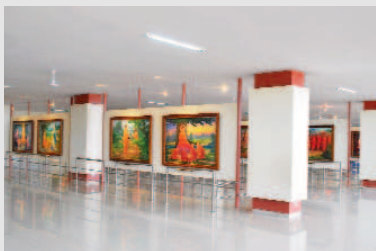
The photo gallery housing 117 paintings