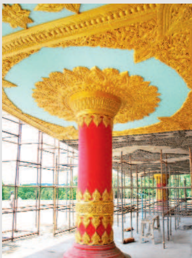
The intricate work seen at the entrance