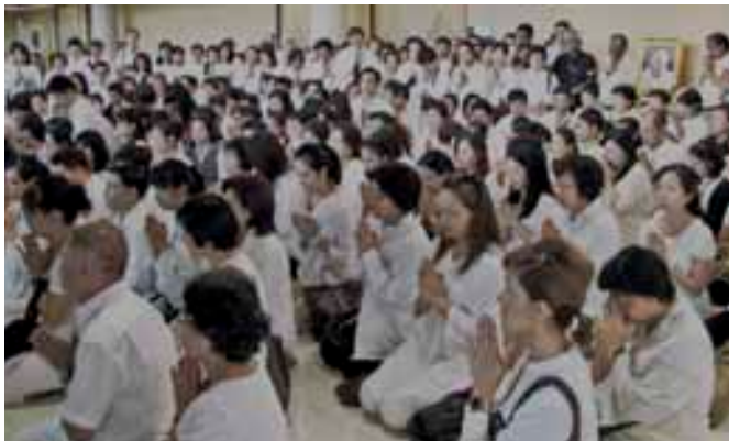
People paying homage at Thailand Airport.

In the morning at 9:00 AM on 8th October, Sanghadana was performed at the Goenka-Residence in Myanmar and 90 monks were given donations. Thereafter at 11:00 AM, the Asthi-Kalash (the Urn containing the ashes) was carried from Dhamma-Joti to Botataung Jetti. There, the Sons and Grandsons of Venerable Goenkaji reached the middle of the Yangon River (Irrawaddy) on a special motor-boat and consigned some part of the Relics. Coincidentally, 56 prisoners were released at the same time by the Burmese Government. The Ashti-Kalash was brought back and placed at the Dhamma-joti.