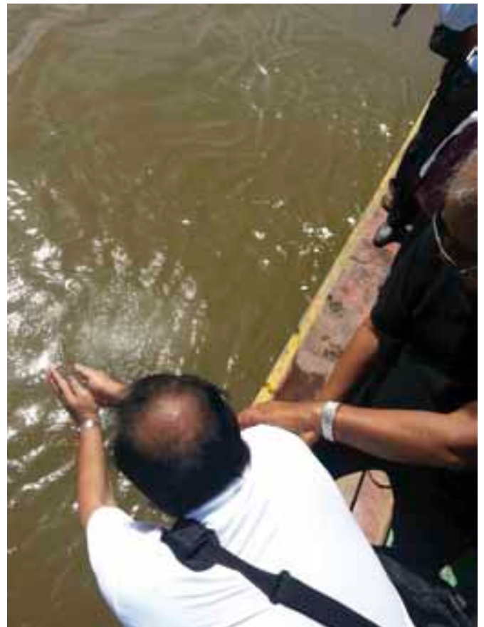
Immersion of ashes in the Irrawaddy River (Yangon).

In the night on 7th October, tremors of an earthquake (rector 3.1) were felt at 02:27 P.M. This was considered as an indication of his final welcome by nature in the Birth Place of Venerable Goenkaji. In June 1969 when Venerable Goenkaji arrived in India from Burma, at that moment also tremors of light intensity were felt in India.