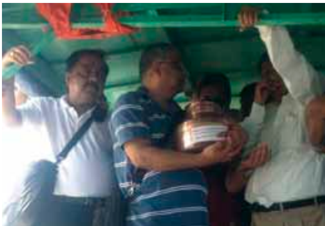
Towards immersion of ashes in the Irrawaddy River in Myitkyina.

In the evening, the reputed Monk of Myanmar,