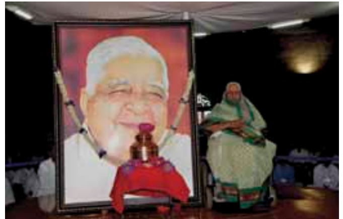
Group-sitting in the Meditation Hall of the Global Pagoda, Gorai, Mumbai.