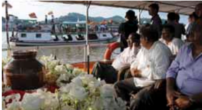
A view of the boats in the Irrawaddy River in Mandalay.

The procession took around 1.5 to 2 hours to reach the banks of Ayeyarwady River at the Panmadee Jetti. Five specially decorated large motor-boats were arranged at the bank. The family members along with the Asthi-Kalash and the Vipassana Teachers boarded the first boat, Monks boarded the second, Nuns the third, the media people occupied the fourth, and the students and others boarded the fifth boat. The fleet of boats went to the middle of the River to consign the ashes. At the time of the immersion, darkness began to set in. The Government had banned entry of other boats and ships in that area from 12:00 Noon to 7:00 PM.