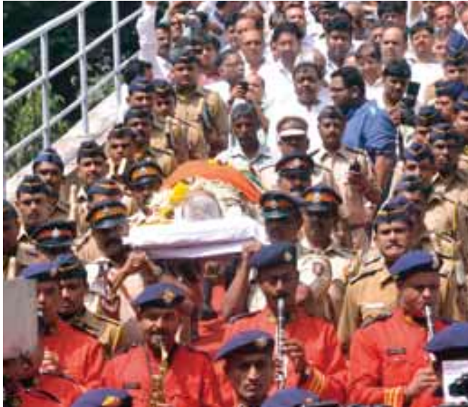
The Police Squad giving the State Honor.

The Government of Maharashtra declared to bid farewell to Venerable Goenkaji with full State honors. Accordingly, an armed police squad in a special turnout was sent. The corporeal body of Venerable Goenkaji was wrapped in a National Flag. As the band played, the squad paid tribute by raising their rifles in unison and firing shots. The police squad accompanied the funeral procession of Venerable Goenkaji up to the cremation ground and after the funeral rites were over once again fired shorts in tribute to the departed. The government had made extensive police arrangements. Some voluntary organizations helped in clearing the 5-6 km long path leading to the cremation ground. The procession was led by some monks while people in thousands followed the procession peacefully in queues to pay their last respects up to the Electric Funeral Ground near Oshivara, Jogeshwari (West). The National Flag brought for paying State Honor was handed over by the Police Squad to the family members to keep alive the memories of Venerable Goenkaji forever.