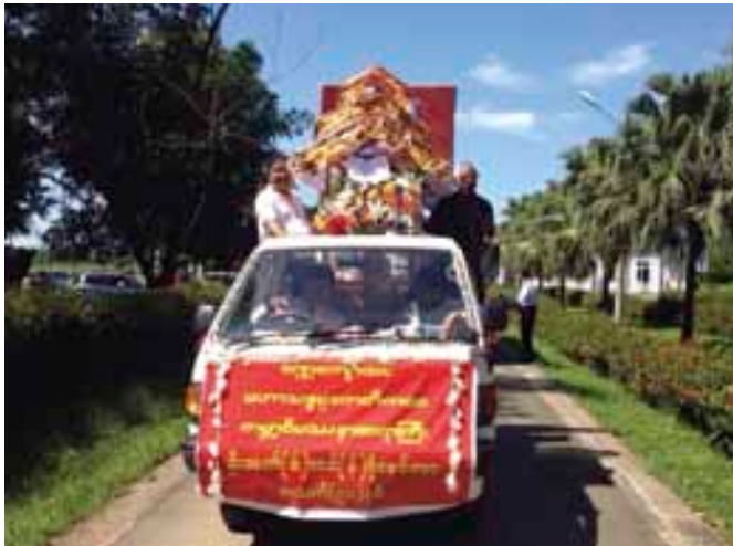
Procession in Myitkyina.

On 9th October the Ashti-Kalash was carried from Dhamma-Joti. The Relics were taken to Myitkyina on a plane from Yangon. After getting down from the plane, a part of the ashes was consigned at the Irrawaddy River in Myitkyina (the starting point of the River). As per the routine, the same flight was to return after half an hour period of stay. The people accompanying the Ashthi-Kalash were required to return to Mandalay on the same day. However, there was no other flight available. So, the same airplane waited for them for about two and half hours (instead of returning after half an hour). Thus they could return to Mandalay the same day, and the Ashti-Kalash was placed at the Vipassana Center, Dhamma Mandala so that the people could pay their respects.