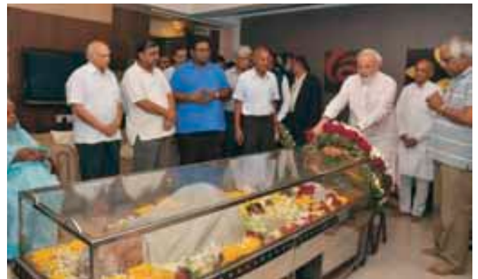
Paying respect inside the residence on 30th September.

When the news was given to the few, it spread in the city of Mumbai, and thereafter the news spread like fire in the whole world. From that instant in the night, the telephone bells started ringing and the people started pouring. Many of the family members were in foreign countries. It was natural that they would take more than 24 hours' time to reach here. Therefore, a decision was taken that his body would be kept at the residence itself in a glass case with auto-freezer and the funeral rites would be completed by afternoon on 1st October. Throughout the day people kept pouring (in thousands) to express their condolence and giving way to others.