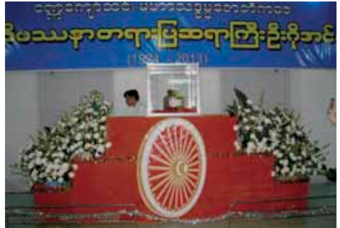
The Urn at the Dhamma-Joti Centre, Yangon.

The number of devotees in Thailand is quite large as there are nine Vipassana Centers. They booked two rooms in the lounge itself with the help of the Government and the Airport authorities and made arrangements for paying homage. About 20 people walked up to the door of the airplane with the permission of the officers and gave a warm welcome to the people carrying the Relics. They wanted to take VISA, but the Officers gave them permission to reach the Lounge outside the Airport after keeping passport in their custody. The Urn containing the Relics was placed on the podium with a large photograph of Venerable Goenkaji and decorated with white lotus flowers. In spite of the incessant rains pouring throughout the night, hundreds of students assembled there. For one hour, every one of them, as per his or her turn, paid homage to Shri Goenkaji and expressed gratitude. An exceptional thing happened when the airplane touched the land: the rains which had poured incessantly throughout the night had stopped providing relief to the people.