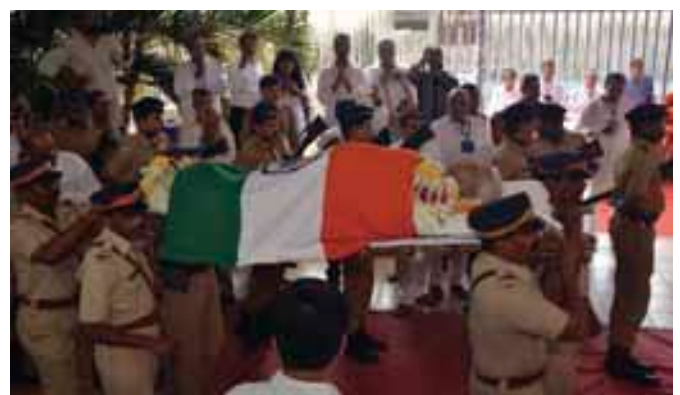
The Police Squad escorting from the Pandal (Tent)

At 10:00 PM in the night itself, about five hundred people were standing on the road in a queue outside the building. Some of those who came from far away distances stayed in a tent for the whole night. The rest were requested to come in the morning. Again in the morning from 7:00 AM onwards on 1st October, people started thronging the place. There were long queues of visitors till 10:15 AM. At 10:15 AM, his corporeal body was brought down and people formed a queue and paid their respects till 11:30 AM.