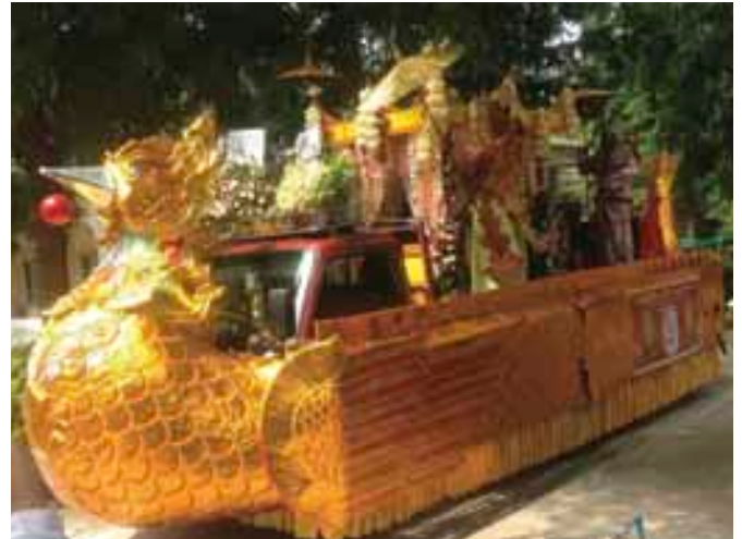
Procession in Mandalay.

Truly all conditioned things are impermanent. All the conditioned, things, individuals which arise are impermanent. Arising and passing away is their inherent nature (dhamma), their inherent characteristic. When this phenomena of constant arising and passing away is extinguished completely by the practice of the Vipassana meditation – the cycle of repeated arising stops, this is known as the ultimate happiness, the ultimate bliss of Nibbana.