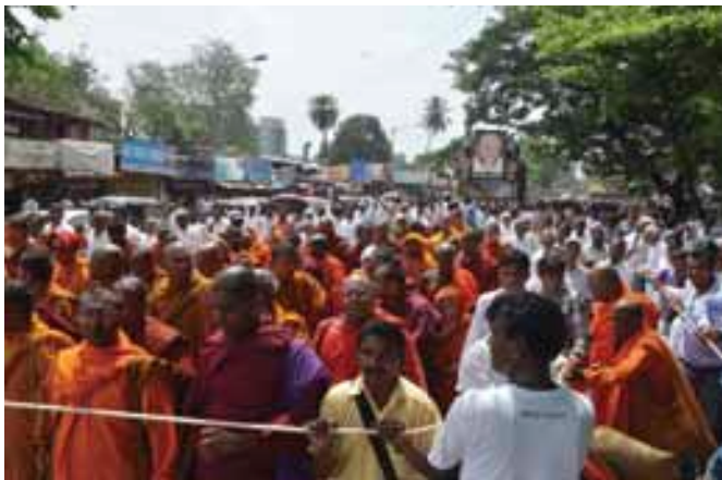
The Procession at Mumbai, People following the Monk.

The Government of Maharashtra declared to bid farewell to Venerable Goenkaji with full State honors. Accordingly, an armed police squad in a special turnout was sent. The corporeal body of Venerable Goenkaji was wrapped in a National Flag. As the band played, the squad paid tribute by raising their rifles in unison and firing shots. The police squad accompanied the funeral procession of Venerable Goenkaji up to the cremation ground and after the funeral rites were over once again fired shorts in tribute to the departed. The government had made extensive police arrangements. Some voluntary organizations helped in clearing the 5-6 km long path leading to the cremation ground. The procession was led by some monks while people in thousands followed the procession peacefully in queues to pay their last respects up to the Electric Funeral Ground near Oshivara, Jogeshwari (West). The National Flag brought for paying State Honor was handed over by the Police Squad to the family members to keep alive the memories of Venerable Goenkaji forever.